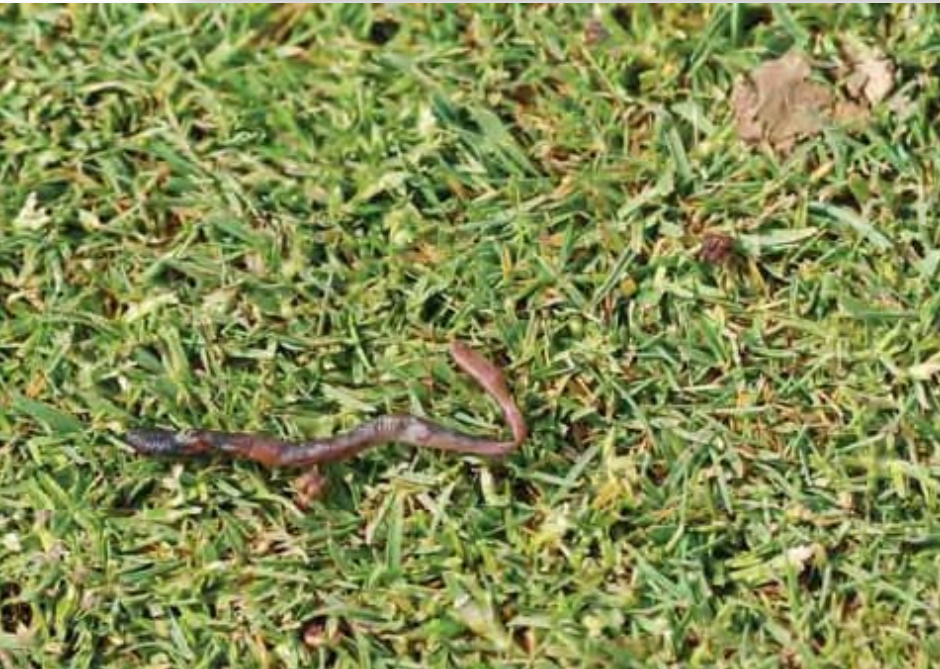
(Top) Earthworms expelled from 1 square meter of a push-up green after tea seed meal was applied. (Bottom) This desiccated earthworm was found the morning after the turfgrass was treated with tree-seed meal.