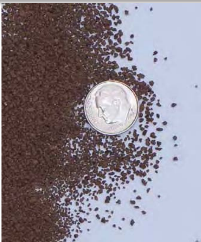
Top: Crude tea seed pellets. Bottom: Early Bird fertilizer. Note the finer granules of the refined product.

culture and specialty agriculture (Ocean Organics Corp., Ann Arbor, Mich./Waldoboro, Maine) expressed interest in developing an organic fertilizer based on tea seed meal. They formulated the raw meal into a finer, proprietary blend of tea seed meal, kelp extract and composted poultry manure, called Early Bird 3-0-1 Natural Organic Fertilizer, suited for golf course use.