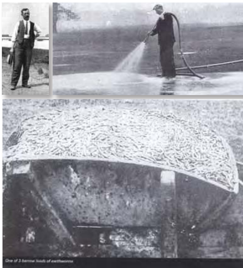
(Top left) In the 1890s Peter Lees, head greenkeeper at Mid-Surrey GC in England, introduced mowrah meal as a means of controlling earthworms on golf courses. (Top right) Watering in the mowrah meal. (Bottom) One of three wheelbarrow loads of earthworms removed from a putting green treated with mowrah meal. Photos published by R. Beale in 1908 (3) and reprinted by J. Beard (4)

Mowrah meal is rich in saponins , natural soaps or surfactants found in the leaves and seeds of oats, spinach, alfalfa, chickpeas, soybeans, ginseng, tea and hundreds of other plants (6,15). Saponins have antifungal and antibacterial activity and form part of the plant's natural defenses against disease. Plant saponins are used in manufacture of natural soaps and shampoos, cosmetics, and even