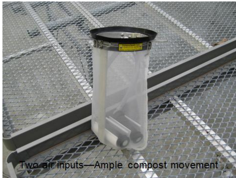
Two air inputs—Ample compost movement